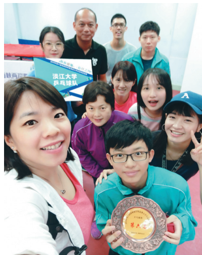
Be spirited and stout.